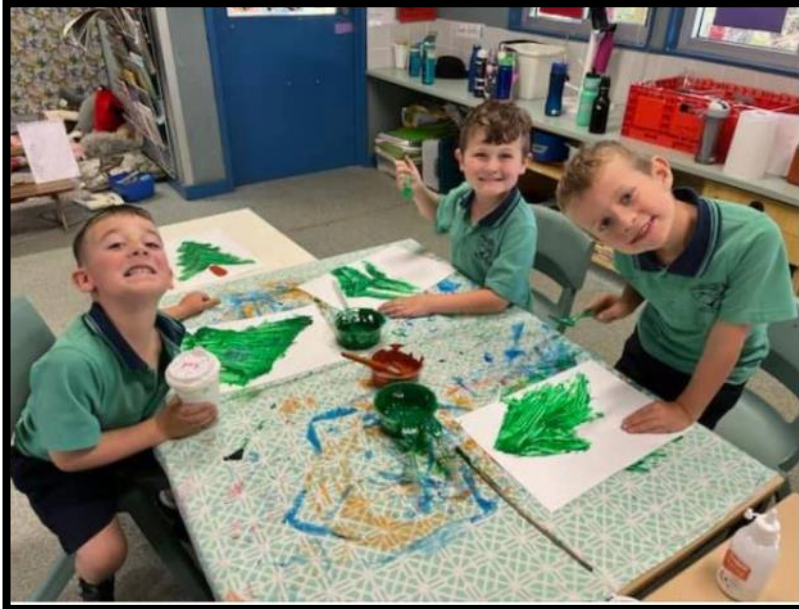
This week KS has been getting into the Christmas Spirit by helping set up the tree, designing their own trees using forks and paint, as well as using their teamwork to make paper chain decorations for our classroom.